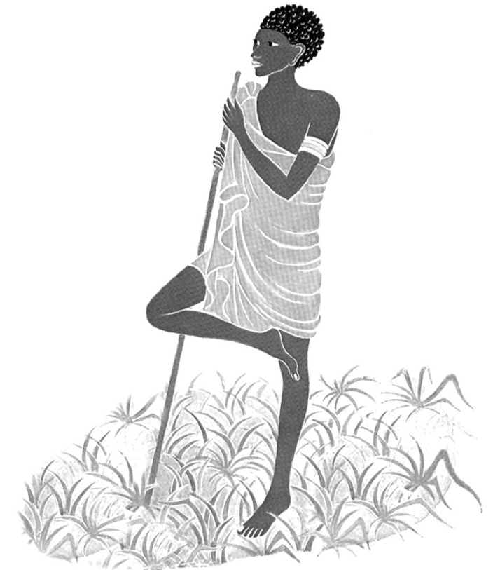
Bringing the Rain to Kapiti Plain by Verna Aardema, Pictures by Beatriz Vidal, Published by The Dial Press, New York