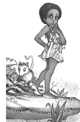
Liza Lou and the Yeller Belly Swamp by Mercer Mayer Published by Parents' Magazine Press • New York